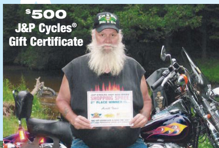
$500 J&P Cycles® Gift Certificate