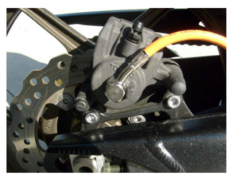
b. Rear caliper