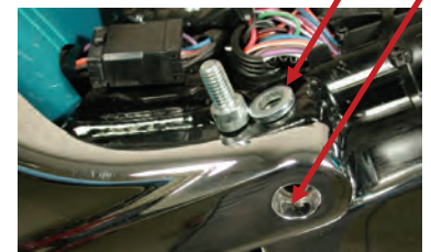
Steps 1 and 2