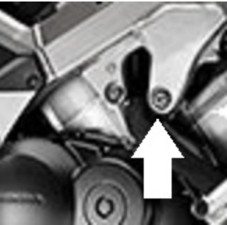
Assembly positions (both sides)