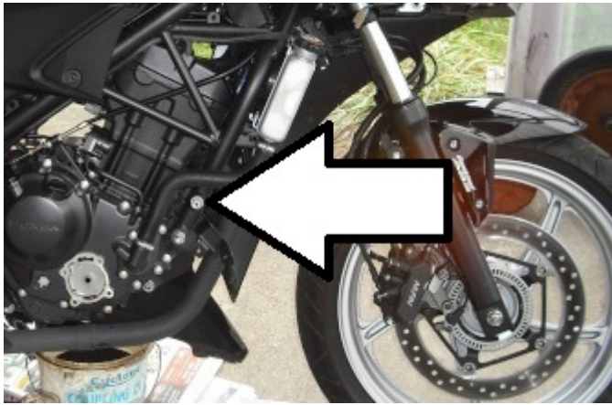
Assembly position (both sides)