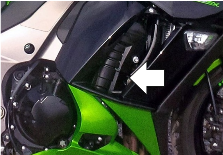
Assembly position (both sides)

year of production: '11- product code: SR137