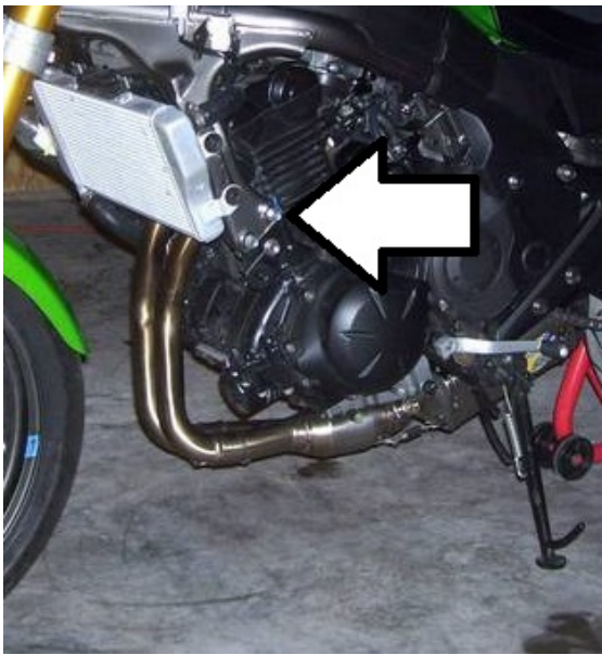
Assembly position (both sides)