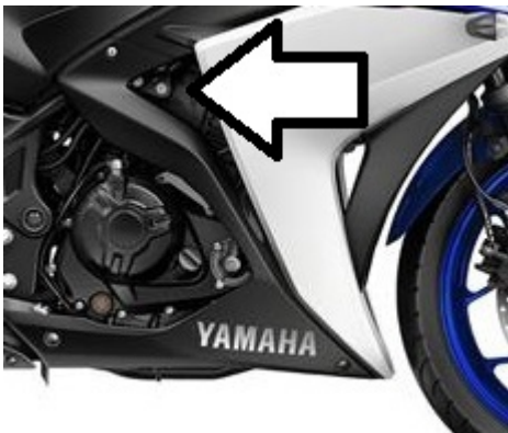
Assembly position (both sides)