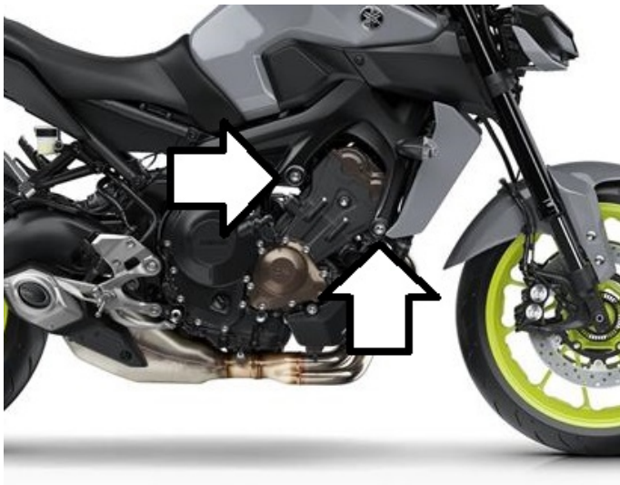
Assembly positions (both sides)

year of production: ALL product code: SR183